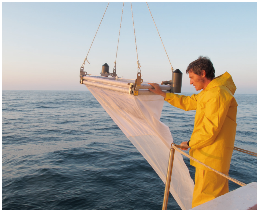
The author, on board of the ship Urania , in a scientific cruise (2013).