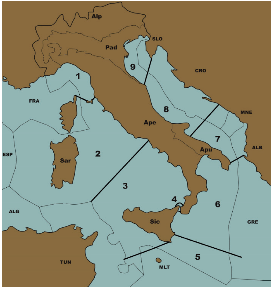
Geographic subdivision of Italian sea. Alp, Ape, Pad, Apu, Sar, Sic, indicate six faunal districts on land. Numbers (1–9) indicate the marine biogeographical districts. ALB, ALG, CRO, ESP, FRA, GRE, MLT, MNE, SLO, TUN, indicate the Countries sharing the marine border with Italy.