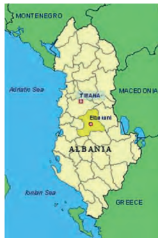
Fig. 1. Geographical position of Elbasan district.

Besides agriculture activities carried out near the lake boundaries using intensively herbicides and pesticides, uncontrolled urban sewage effluent would notably contribute to incessant deterioration of standart water quality (VRIJHEID, 2000; PALMER et al. , 2005).