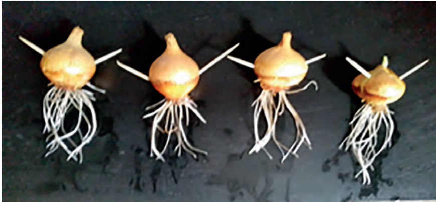
Fig. 3. Root growth at the end of the experiment.

The means, with 95% confidence limits and the standard errors for results of the root inhibition and chromosome aberrations were calculated for each sample of the waters. Data were expressed as Mean Differences between the control and the different samples of the lake water were analyzed by means of the Student's unpaired t-test.