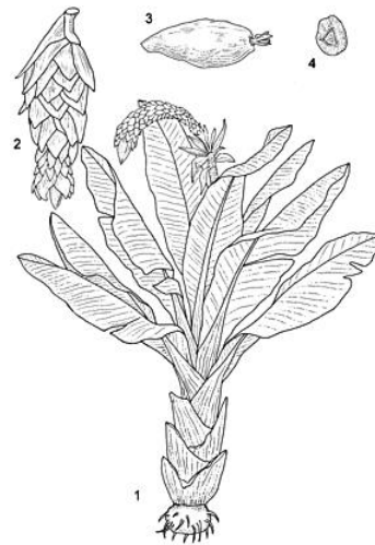
Figure 4 - [ Ensete ventricosum (Welw.) Cheesman]. Habit of flowering plant (1); inflorescence (2); fruit (3); seed (4). Redrawn and adapted by M.M. Spitteler