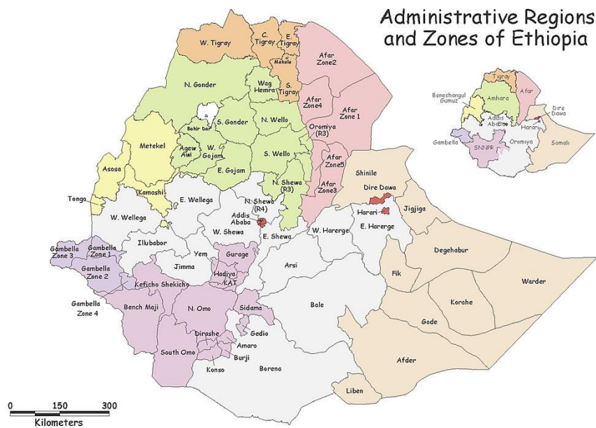
Figure 1 - Map of regions and zones in Ethiopia. All boundaries are approximate and unofficial.

moves from the ground up, is therefore perfectly suited for explaining how the Hadiya farmers approach rules and obligations while at the same time exploiting resources from inside the normative system.